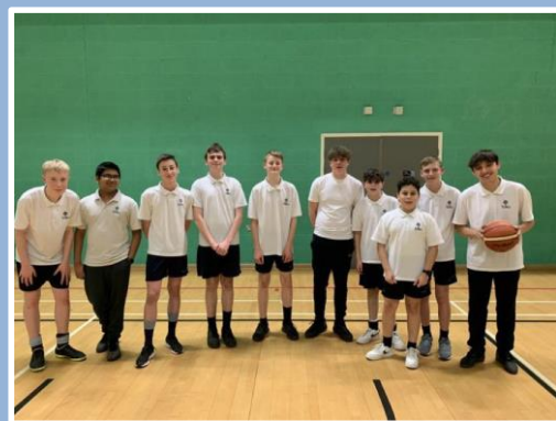
Year 7 Basketball