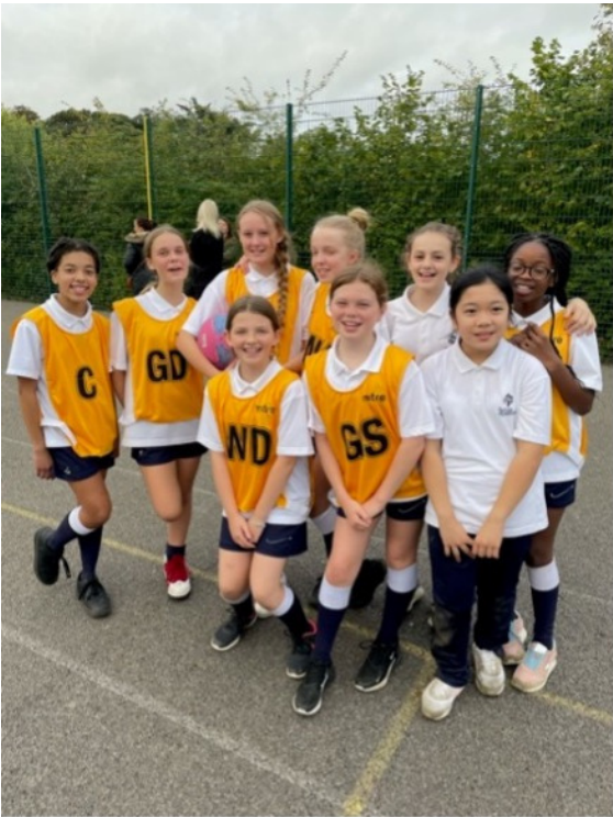
Year 7 Netball